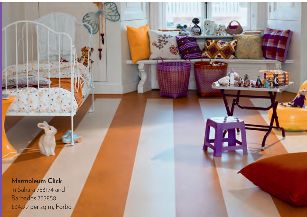
Marmoleum Click in Sahara 753174 and Barbados 753858, £34.99 per sq m, Forbo.