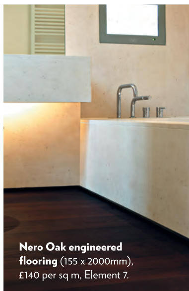
Nero Oak engineered flooring (155 x 2000mm), £140 per sq m, Element 7.