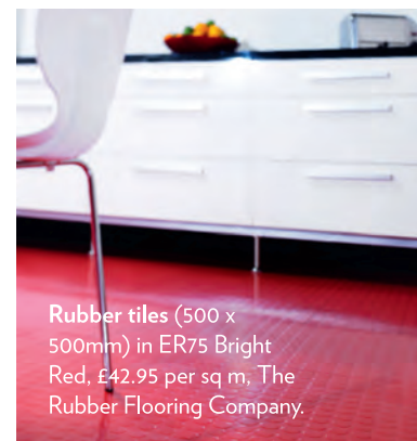
Rubber tiles (500 x 500mm) in ER75 Bright Red, £42.95 per sq m, The Rubber Flooring Company.

WHERE TO BUY Dalsouple, The Rubber Flooring Company, Polymax.