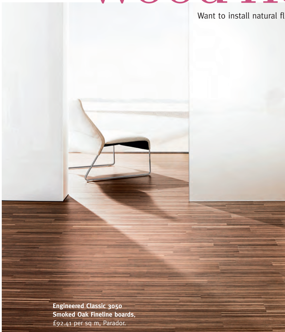
Engineered Classic 3050 Smoked Oak Finline boards, £92.41 per sq m, Parador.

Want to install natural flooring but can't see the wood for the trees? Whatever